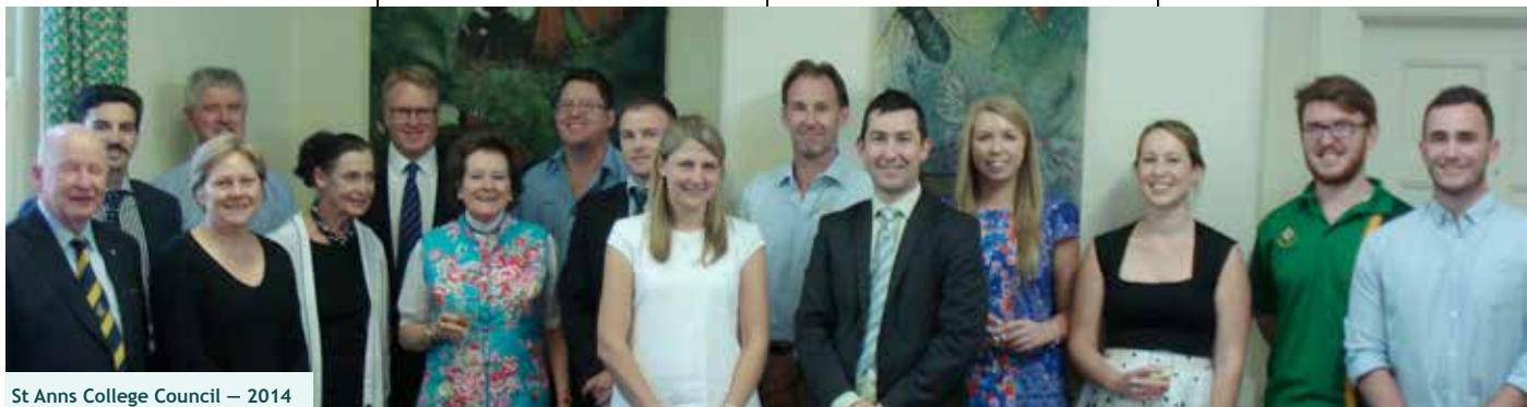
St Anns College Council – 2014