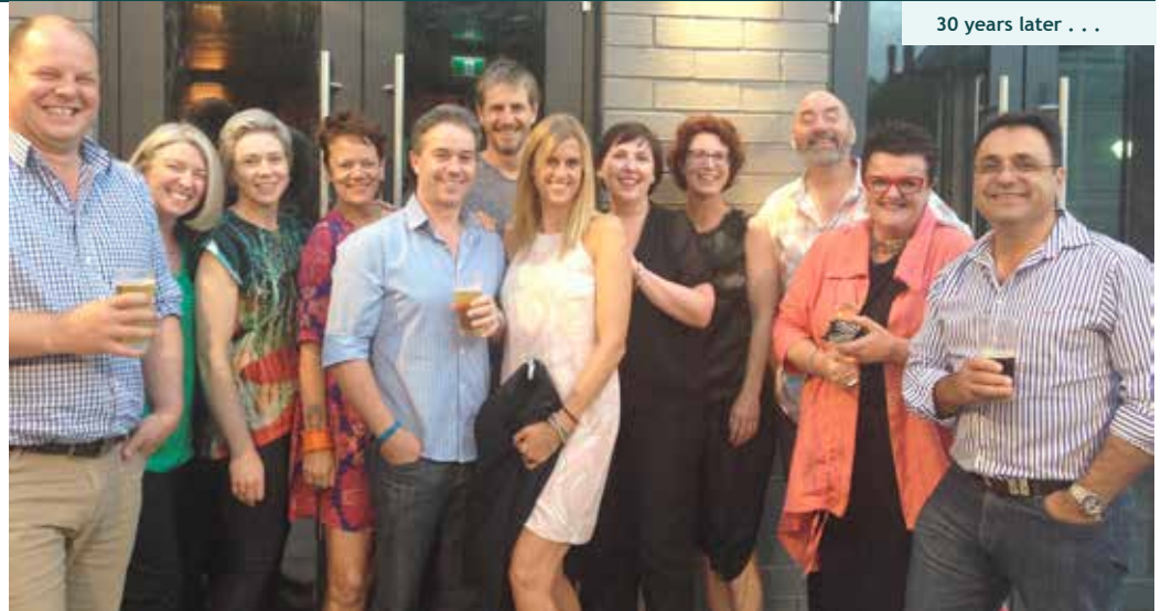
30 years later . . .