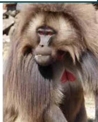
DB and Simon went to Baboonland in the holidays - here's a Gelada Baboon in Ethiopia