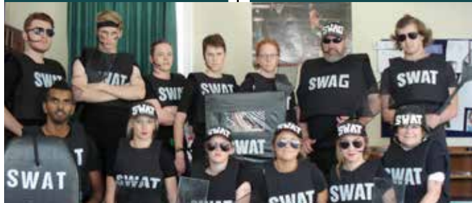
The tutors at the VD looking very tough as a SWAT Team (all except one) – they even have SWAG