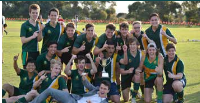
St Ann's Soccer 2014 – the boys were victorious – Go the Boons